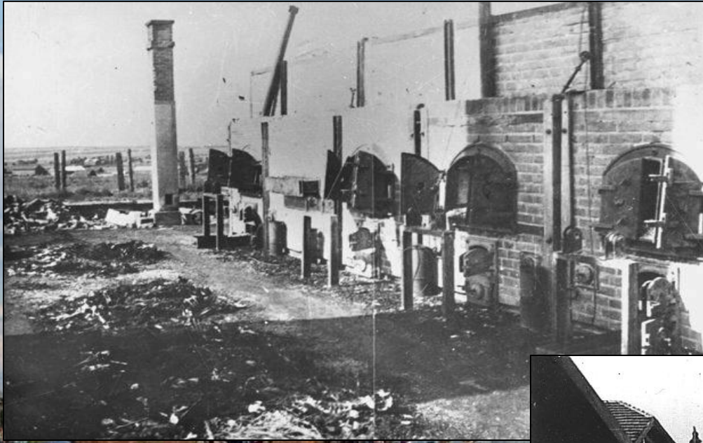
Crematoria at Majdanek

Entrance to Auschwitz: Work Makes You Free