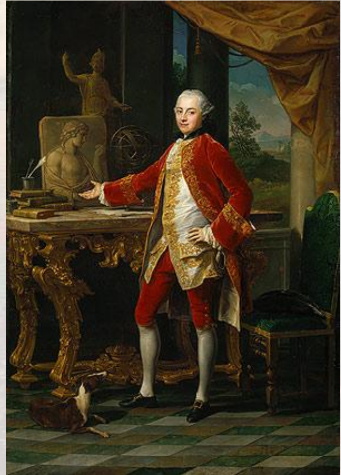
Portrait of a Young Man , ca. 1760–65, Pompeo Girolamo Batoni