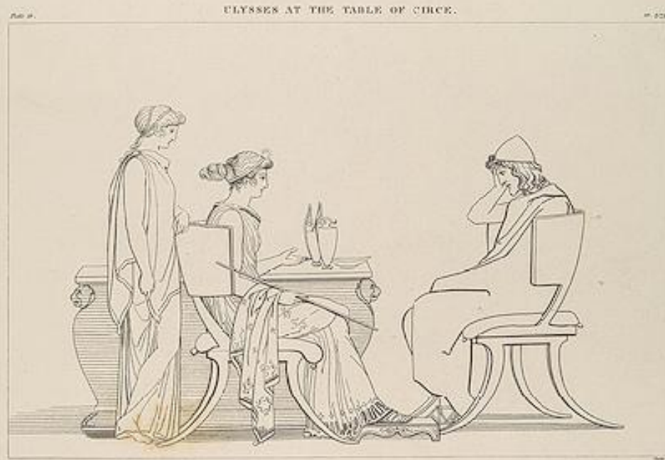
WHY ME? ULYSSES: HELENE & SPARTE. HOME BOARD OF GREY CROSS BARROWED AT THE BEAST.

English Museum, Collection 4, 10, 11, 12, 13