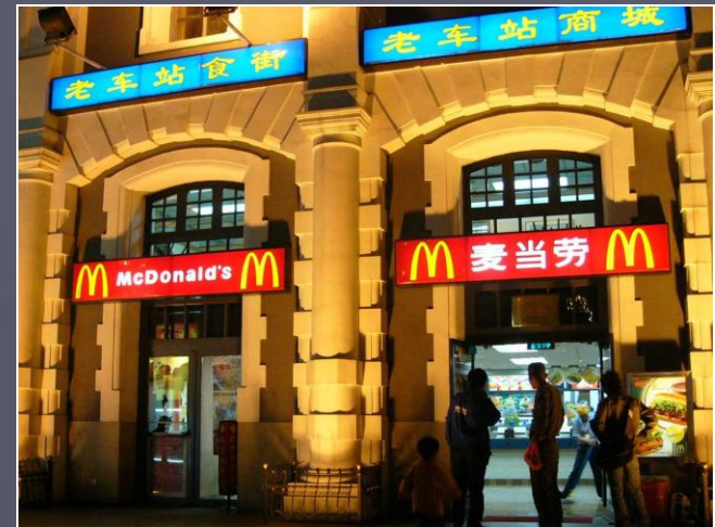
McDonalds in Beijing