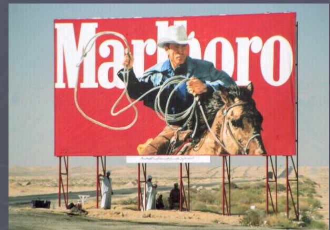
Marlboro man in Egypt