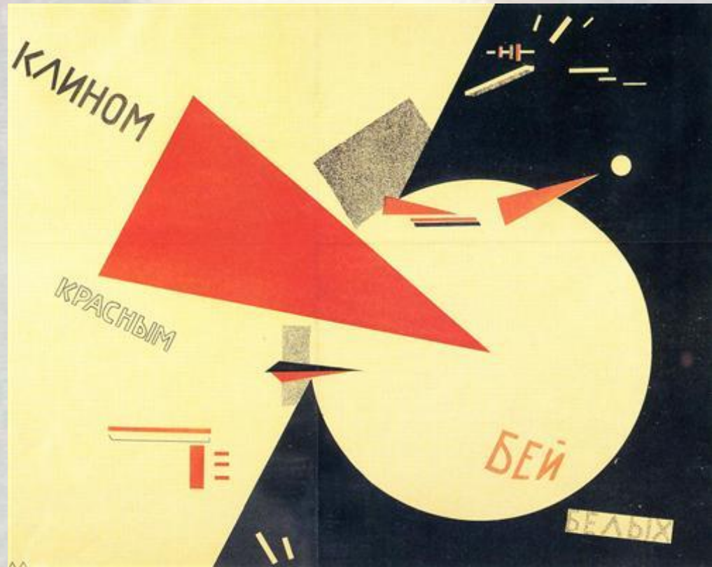
Beat the Whites with the Red Wedge EL Lissitzky, 1920